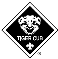
TIGER CUBS (WITH ADULT PARTNER)

Age- and rank-appropriate guidelines have been developed based on the mental, physical, emotional, and social maturity of Boy Scouts of America youth members. These guidelines apply to Cub Scout packs, Boy Scout troops, Varsity Scout teams, and Venturing crews.