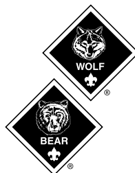
WOLF/BEAR CUB SCOUTS