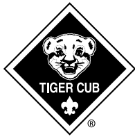
TIGER CUBS (WITH ADULT PARTNER)

Age- and rank-appropriate guidelines have been developed based on the mental, physical, emotional, and social maturity of Boy Scouts of America youth members. These guidelines apply to Cub Scout packs, Boy Scout troops, Varsity Scout teams, and Venturing crews.